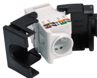
C. Rear view of Keystone with wire cap attached